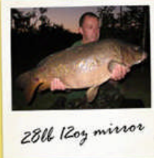
28lb 12oz mirror

"The UK Carp Fishing Secrets ebook undoubtedly helped me improve my fish location techniques and baiting strategies and has contributed to my best season ever, I am now catching consistently on my local water with a number of 20s and 30s gracing my net over the last few months and a new PB common to boot at 39lb!... I would thoroughly recommend this ebook to anyone who is not only looking to improve their carp catching ability but anyone wishing to save a few quid by following some of the cost saving techniques on baits and rigs in the book."