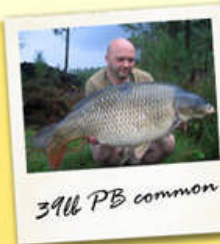
39lb PB common